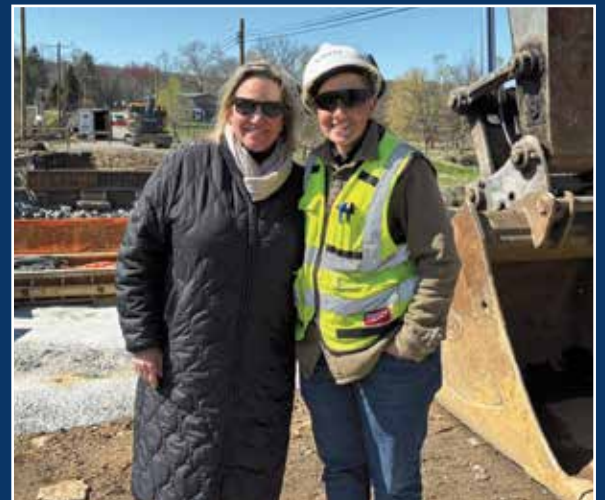
Visiting Rt. 82 Bridge Construction Site.

I urge anyone traveling on Route 82 to follow PennDOT signage for the official detour using Routes 841 & 842. Please do not use alternate routes, as this creates unsafe travel on local roads.