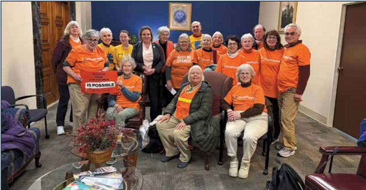
Residents from Kendal-Crosslands Communities visit the Capitol.