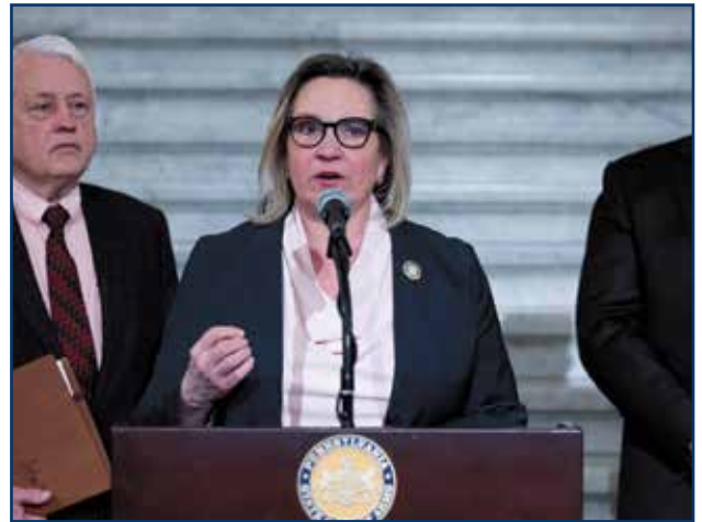
Working Families Tax Credit Press Conference.