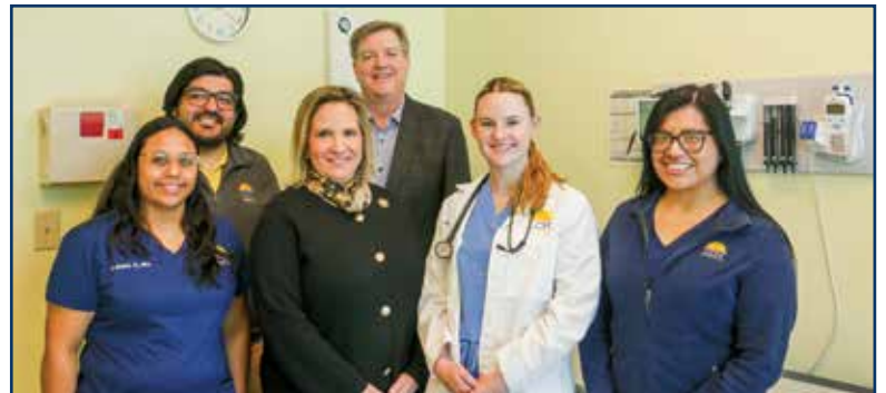
Tour and Visit to LCH.