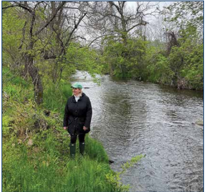
Visiting White Clay Creek Preserve.